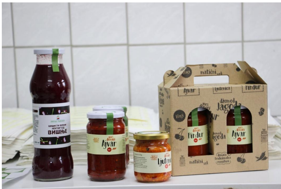
Photo No. 3: Food products by Darovi Lužnice

While they have yet to implement targeted initiatives to address sustainability challenges, the cooperative remains focused on expanding production while maintaining its organic and traditional quality standards. They aim to enhance their visibility and reputation in both domestic and international markets. Their vision includes encouraging other cooperatives in the region to adopt organic practices, further solidifying Babušnica as a recognized hub for sustainable, organic food production. Although sustainability has not yet brought significant financial benefits, the cooperative's status as the first women-led agricultural cooperative in southern Serbia has earned them recognition and respect. However, systemic challenges in rural Serbia - such as poor economic development, lack of specialized workforce, and limited market support - continue to hinder their progress. Despite these obstacles, Darovi Lužnice remains committed to promoting sustainability and empowering women in their community.