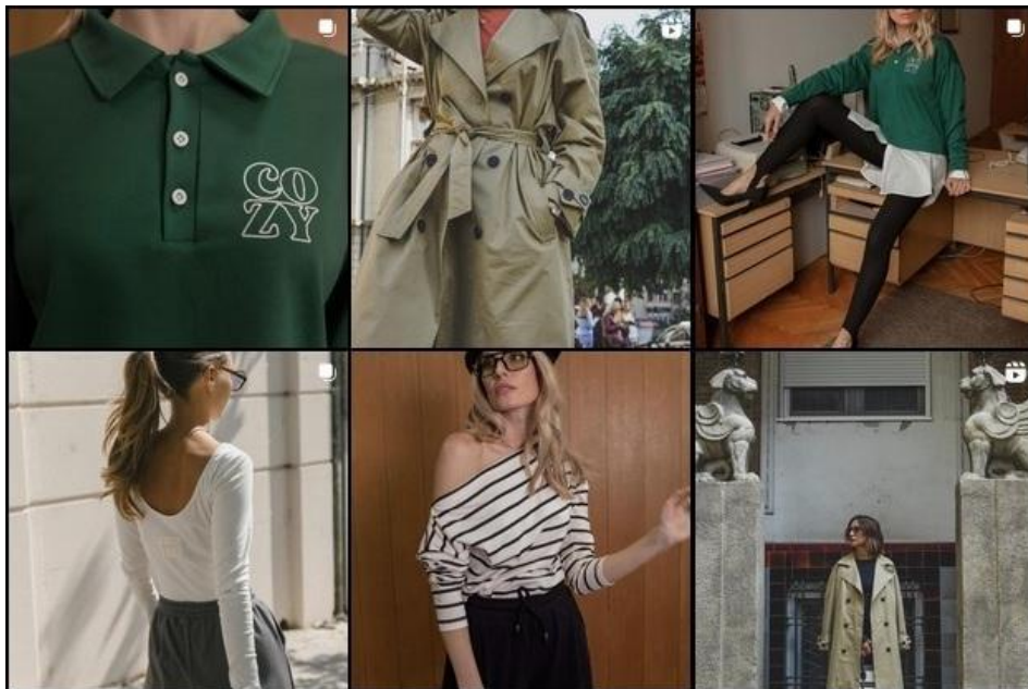
Photo No. 2: Sustainable fashion products by COZY2WEAR

biodegradable packaging, more difficult. Operating a sustainable business in Serbia presents financial challenges, as eco-friendly materials and practices often come at a higher cost. However, the positive feedback from customers and the growing sense of a like-minded, environmentally conscious community motivate COZY2WEAR to persevere. This brand exemplifies how small businesses can advocate sustainability in challenging environments, proving that eco-conscious choices and ethical practices can transform the fashion industry - one timeless garment at a time. Despite these obstacles, COZY2WEAR is committed to advancing circular economy practices. The company plans to introduce a clothing return policy, partnering with textile recycling firms to repurpose old garments. Negotiations with recycling companies are underway to ensure a seamless implementation of this initiative.