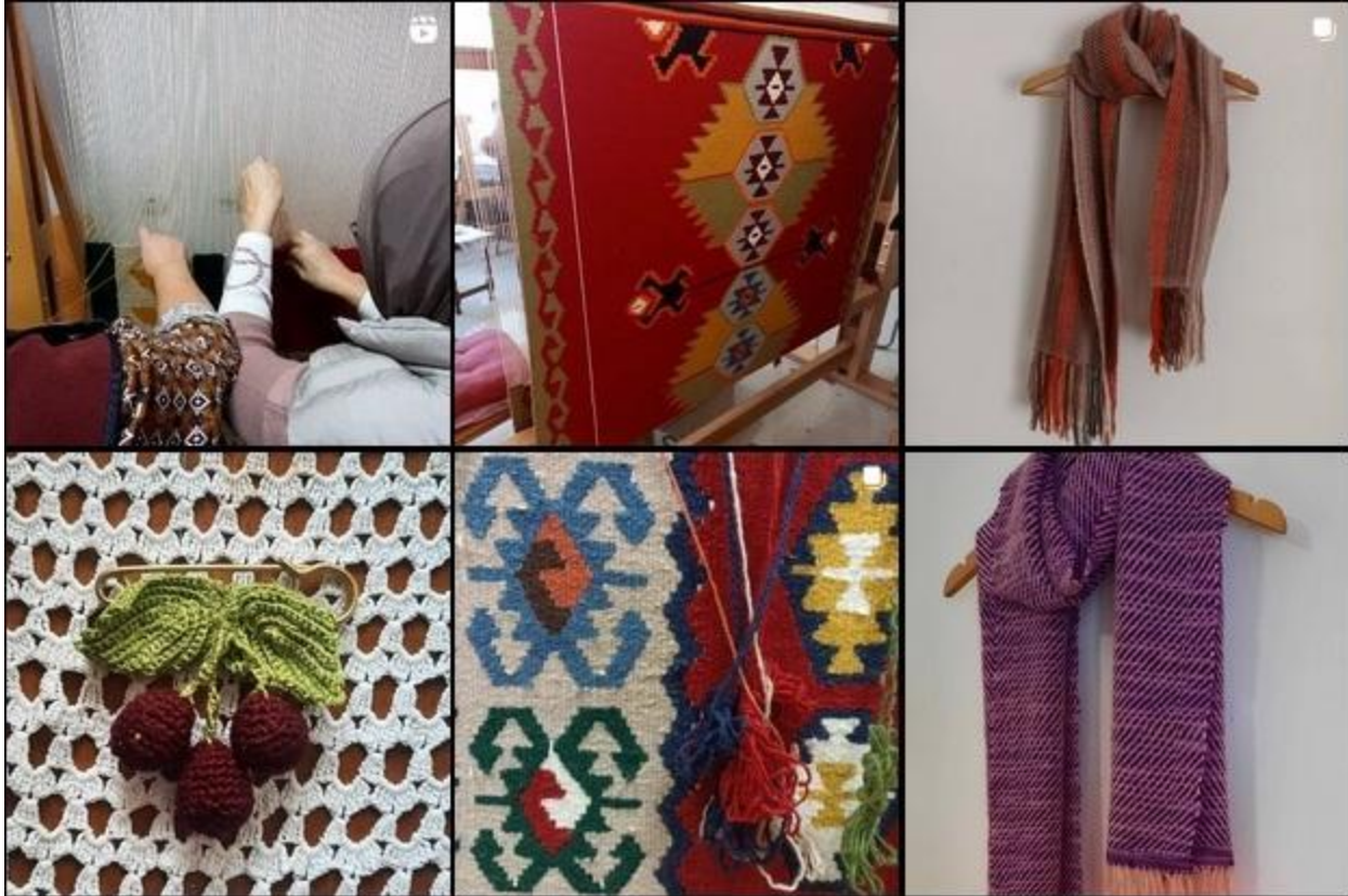
Photo No. 1: Tradition, fashion and sustainability - Pletisanka